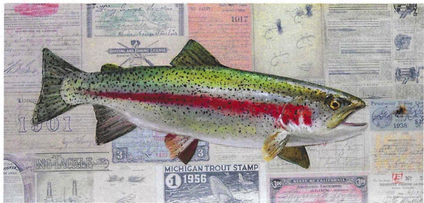
Rainbow Trout , pastel on fishing ephemera, 14 x 24"