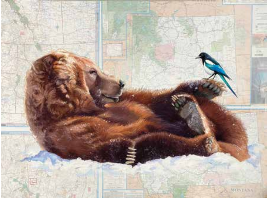
Kodiak Moment , pastel on state maps, 34 x 46" (86 x 116 cm)