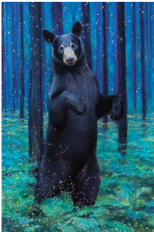
Dancing with Fireflies , pastel and gold leaf on panel, 36 x 24" (91 x 60 cm). Winner of the 2022 American Women Artists "People's Choice" award during the exhibit Breaking Through: The Rise of American Women Artists .