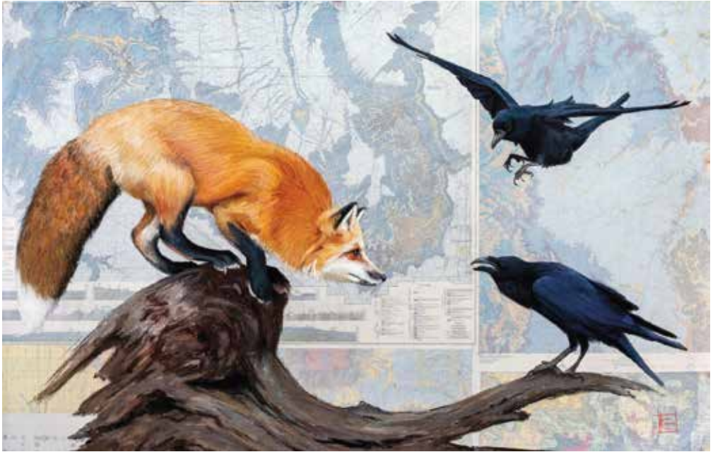
One Must Be A Fox To Recognize A Trap , pastel on geographical maps with pearl, 21 x 33" (53 x 83 cm)