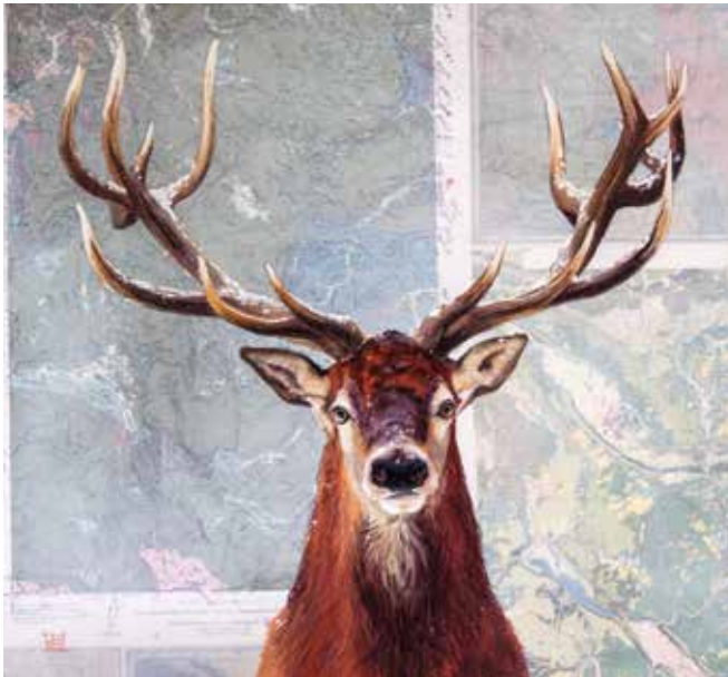
Ice-cold Ginger Deer , pastel on Western geographical maps, 24 x 26" (60 x 66 cm)

in oils. Experience with both [drawing and painting] refined and focused my career objectives. Then there was yet another unexpected twist before graduation: in a classmate's castoff supplies, I found my true medium: pastels."