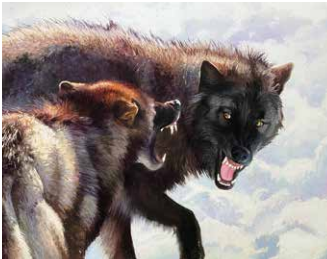
Sibling Rivalry , pastel on panel, 24 x 30" (60 x 76 cm)