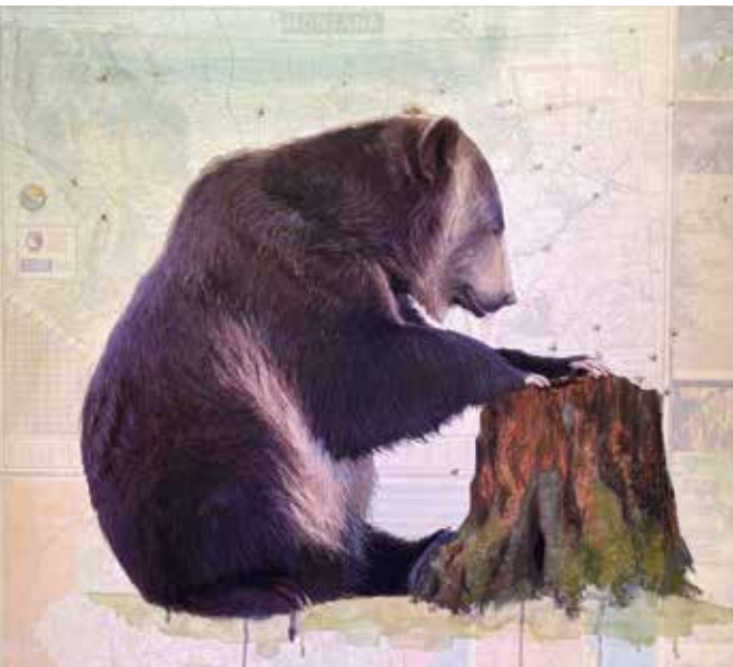
What Hive We Here? , pastel on national park maps, 36 x 40" (91 x 101 cm)