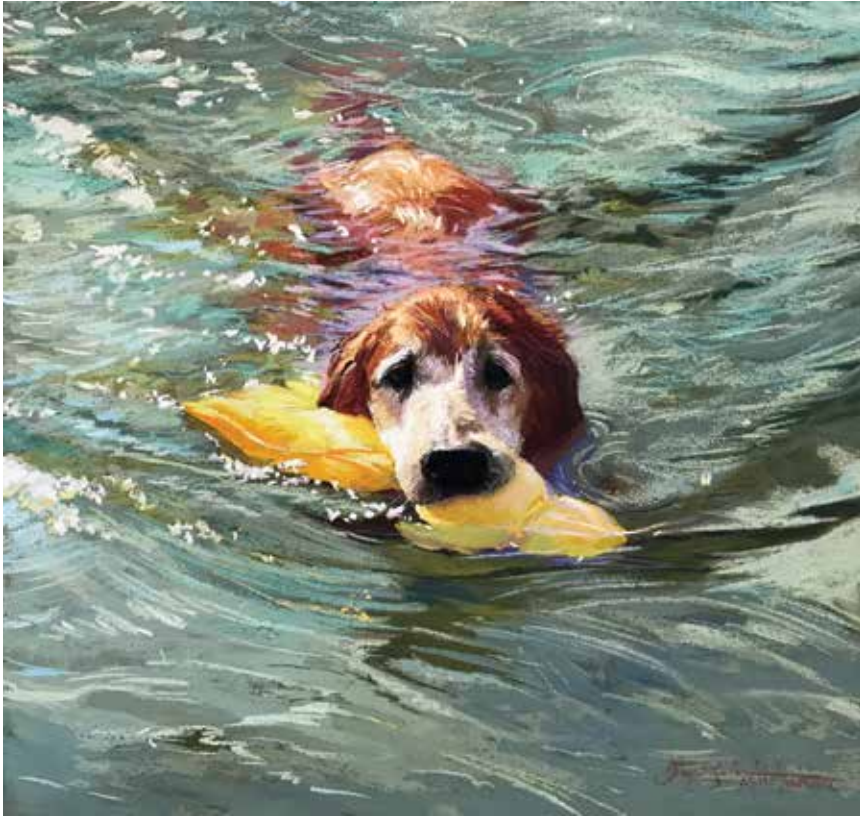
Diesel , pastel on panel, 24 x 24" (60 x 60 cm)